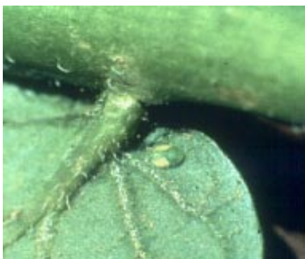
Figure 2: Psyllid nymphs feeding on potato leaf.