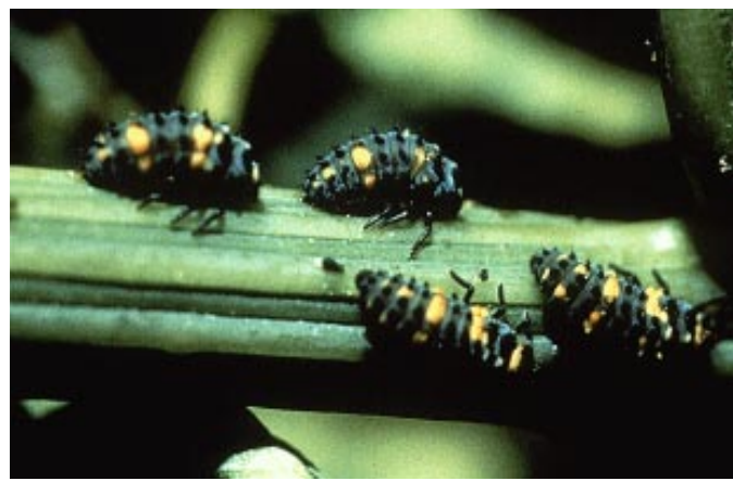
Figure 3b. Lady beetle larva.