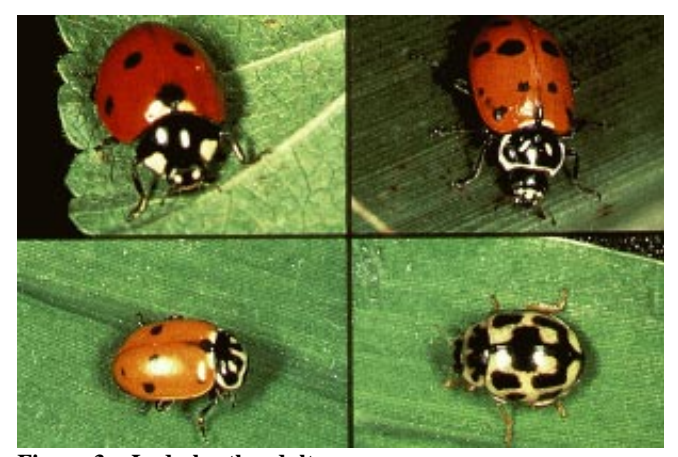
Figure 3a. Lady beetle adult.