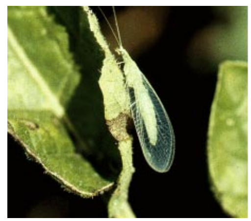
Figure 3c. Lacewing adult.