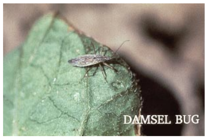
Figure 3e. Damsel bug.