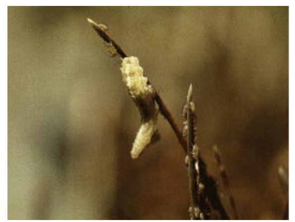
Figure 3f. Syrphid fly larvae feeding on aphids.