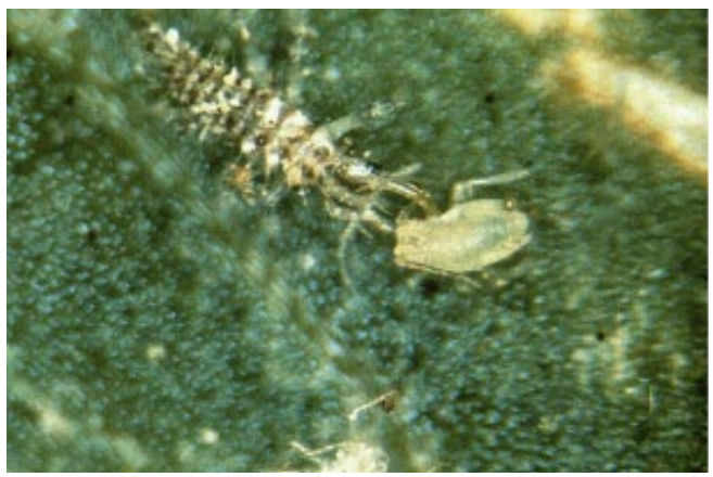
Figure 3d. Lacewing larva attacking aphid.