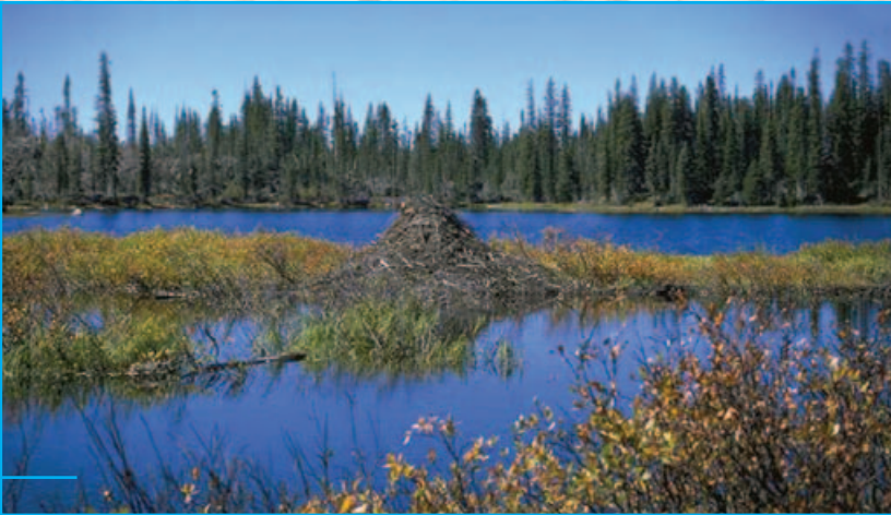
Three Island Lake