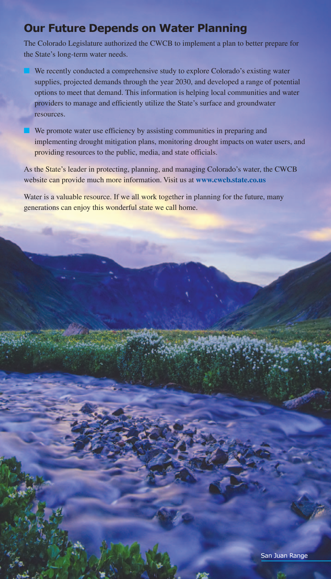
San Juan Range

Water is a valuable resource. If we all work together in planning for the future, many generations can enjoy this wonderful state we call home.