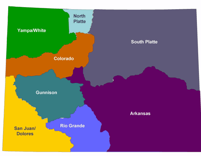
Figure 1 Colorado's Eight Major River Basins

SWSI has examined current water use and supply and has also estimated future water needs based on a per capita water use methodology. Per capita water use was