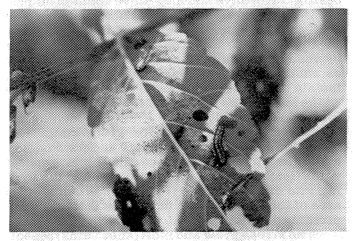
Figure 2: The areas around the feeding site of the larvae dry up and die.

Figure 1: Females lay a series of yellow egg masses.