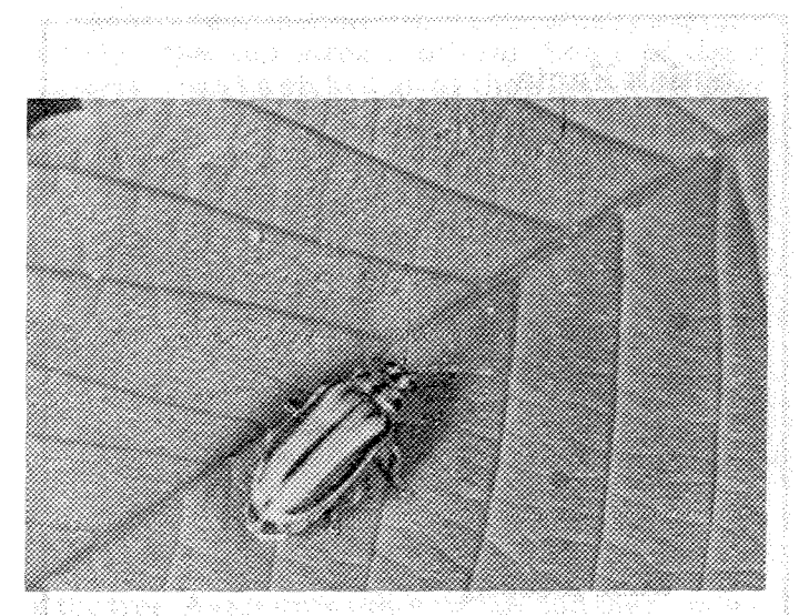
Figure 4: Adults emerge one to two weeks after pupation.