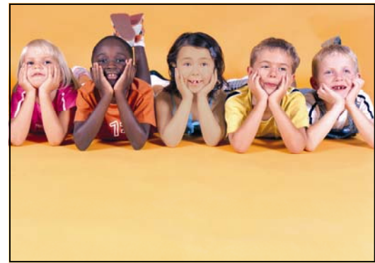
February 19, 2009