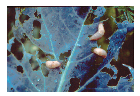
Figure 1: Slugs feeding on broccoli.