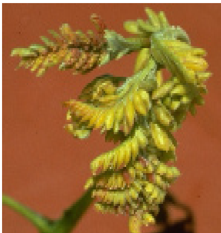
Figure 2: Severe galling produced by the honeylocust podgall midge.