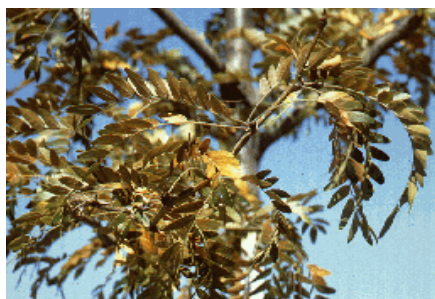
Figure 4: The honeylocust spider mite causes general yellowing of the foliage in midsummer.

Ash-gray blister beetles suddenly may occur in large numbers on trees,