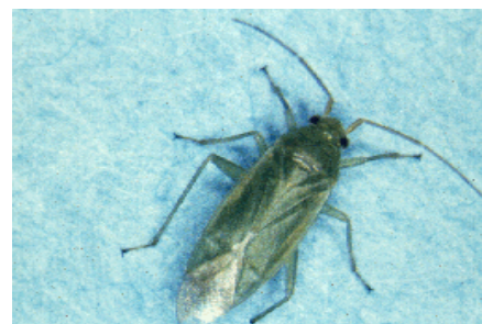
Figure 1: Adult honeylocust plant bug.

Honeylocust plant bugs commonly infest honeylocust in late spring. This common damaging species of plant bug is generally green. When immature, it superficially resembles an aphid but is much more active. Injured foliage shows yellow or brown spotting. Leaves become twisted, and twig dieback can occur during heavy infestations. The honeylocust plant bug particularly favors new foliage.