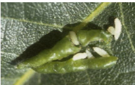
Figure 3: Honeylocust podgall midge larvae.

attacks young midge larvae. Heavy midge infestations often collapse when new growth ceases and the trees are no longer attractive to the egg-laying adult midges. In the absence of suitable egg-laying sites, the adult midges apparently go into an inactive diapause stage, renewing activity the following spring.