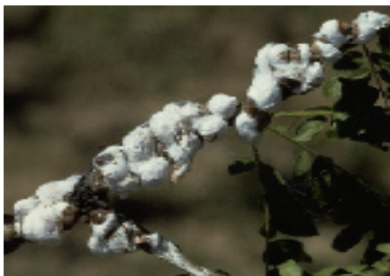
Figure 6: Mature female cottony maple scales with egg sac.

occasionally causing serious defoliation over parts of the tree. Infestations tend to occur most frequently in late June or early July and end as suddenly as they begin. If severe defoliation is threatened, control can easily be accomplished using any of the insecticides commonly used for insect control on trees and shrubs.