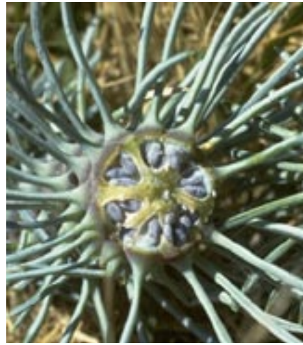
Figure 3: Gall cross-section showing developing insects.

<sup>1</sup>Colorado State University Cooperative Extension entomologist and professor, bioagricultural sciences and pest management.