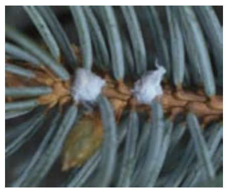
Figure 2: Overwintered females.

Always read and follow mixing and usage instructions on the label. Direct applications against the overwintering insect, preferably before egg production has begun. Treatments usually are best made during warm periods in fall (mid-October or November) or in late March through April.