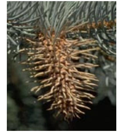
Figure 1: Gall on blue spruce.

Cooley spruce galls are conspicuous and frequently cause considerable concern to homeowners. However, the galls usually do not cause any serious harm to the tree. Extremely heavy infestations may cause