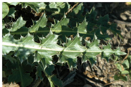
Figure 4. Musk thistle leaves; note cream-colored mid-rib and frosted appearance around leaf margins.