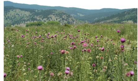
Figure 1. Musk thistle infestation in the Colorado foothills.

Vigorously growing grass competes with musk thistle, and fewer thistles occur in pastures where grazing is deferred. However, musk thistle also can become a problem in pasture or rangeland that is in good condition.