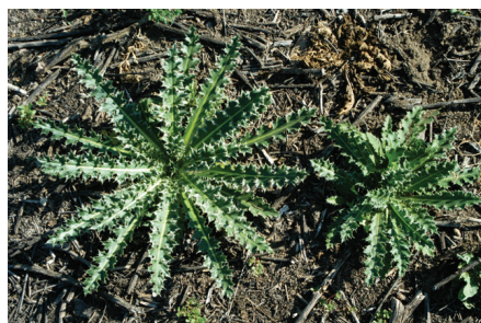
Figure 3. Musk thistle rosettes.