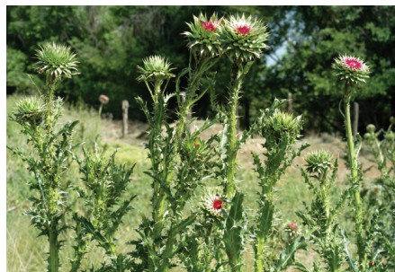
Figure 5. Musk thistle in bud growth stage; note large bracts below developing flower.

Musk thistle flowers over a seven- to nine-week period. It begins to disseminate seed from a head about two weeks after it first blooms. It is common to observe musk thistle with heads in several stages of floral development and senescence. Thus, musk thistle sets seed over an extended time period.