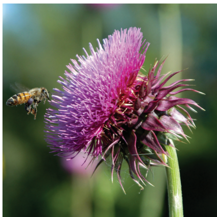
Figure 6. Musk thistle flower; note large bracts and lack of leaves on shoot below flower.

Escort (metsulfuron) or Cimarron Extra (chlorsulfuron) also can be used in pastures, rangeland, and non-crop areas. Research from Colorado State University and the University of Nebraska shows that chlorsulfuron or metsulfuron prevents or dramatically reduces viable seed formation when applied in spring, up to early flower growth stages. The latest time to apply these herbicides is when developed terminal flowers have opened up to the size of a dime. Add a good agricultural surfactant at 0.25 percent v/v 2 to Escort or Cimarron Extra treatments or control is inadequate (equivalent to 1 quart of surfactant per 100 gallons of spray solution).