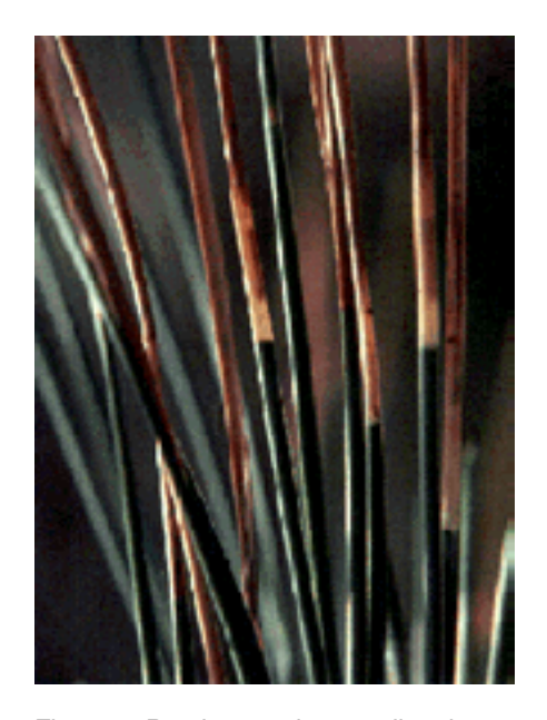
Figure 1: Ponderosa pine needle miner larvae in mined needles.