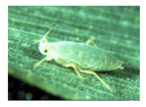
Figure 1. The Russian wheat aphid.