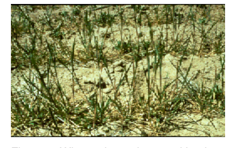
Figure 3. Wheat plants damaged by the Russian wheat aphid.