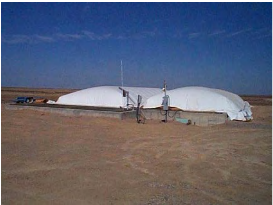
Anaerobic Digester at Colorado Swine Partners