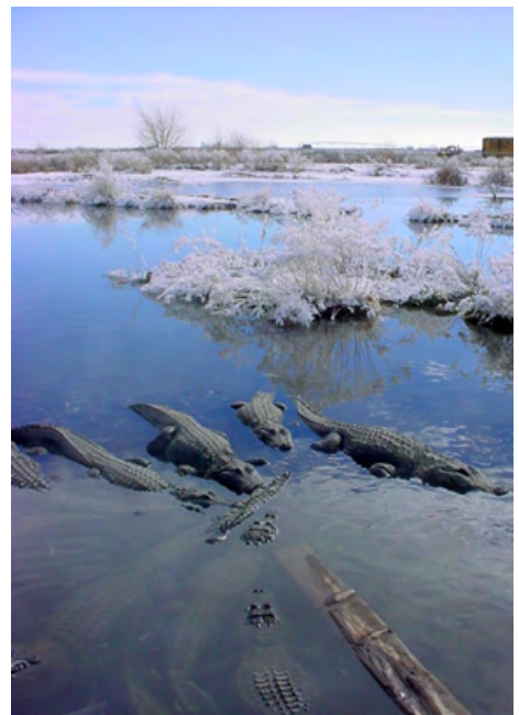
Figure 1. Alligators at Colorado Gator Farm, Mosca, Colorado

Colorado Gators is able to conduct aquaculture in an unlikely area for either warm water fish or reptiles. At an elevation of 7,550 feet, and ringed by the magnificent Sangre de Cristo Range, air temperatures regularly fall to well below zero. Warm water, approximately 87°F, is supplied by a 2,050 foot deep, 14 inch diameter irrigation well. Originally the well sustained artesian flow in excess of 800 gallons per minute. With draught and increasing utilization of the underlying aquifer by adjoining farms, the artesian flow diminished to the point where the owners installed a 40 horsepower variable speed pump to ensure adequate flow year-round. The pump is set at about 40 feet. While the well is permitted for over 2,000 gallons per minute (gpm), current requirements are for approximately 400 gpm.