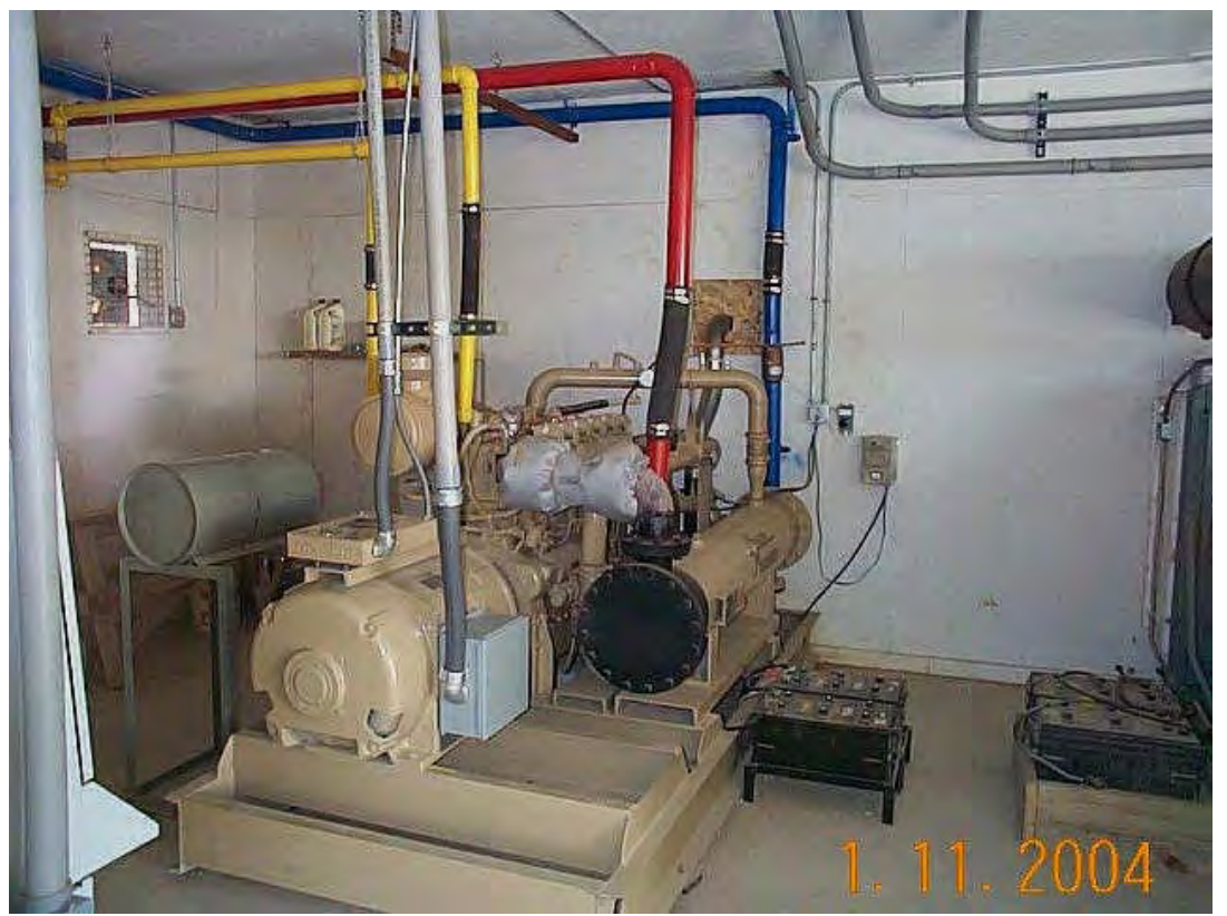
Reciprocating Engine – photo by McNeil Technologies

The digester enabled the farm to reduce energy costs by approximately $1,800 per month (to only $1,400 per month); the facility's average use was 43,233 kWh at a cost of $3,200 per month (at a rate of $.042/kWh). The power is not currently sold to the grid due to the fact that it all used on-site. However, a net metering agreement was established with Tri-State and the system is connected to the power lines via Southeast Colorado Power