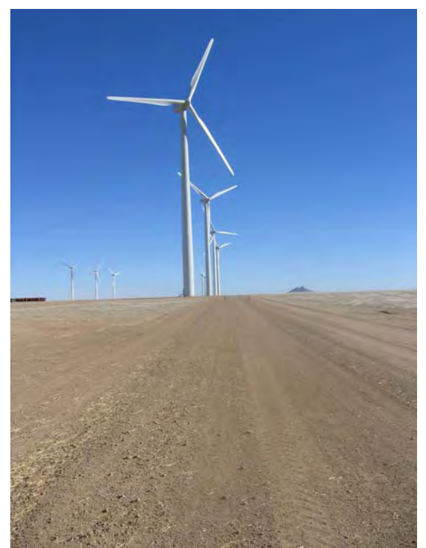
Colorado Green Wind Site.

Wind turbines are manufactured in a variety of sizes, and wind power projects can consist of a single turbine or a large group of wind turbines. Blades can be configured in horizontal or vertical positions, although the horizontal-axis wind turbines dominate the utility scale market. Turbines for farm use typically range in size from 400 watts to 40 kilowatts. The latest utility scale turbines generally have a capacity of at least 1.5 MW, and the industry trend has been to increase the size of each unit.