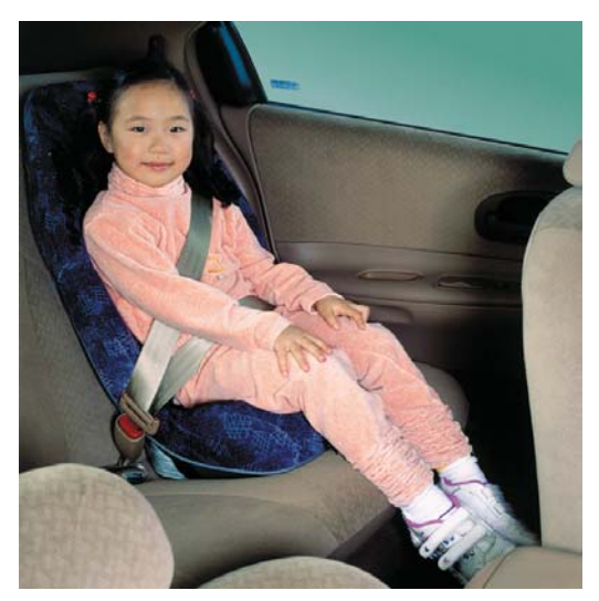
HIGH BACK BELT POSITIONING BOOSTER SEAT