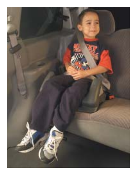
BACKLESS BELT POSITIONING BOOSTER SEAT