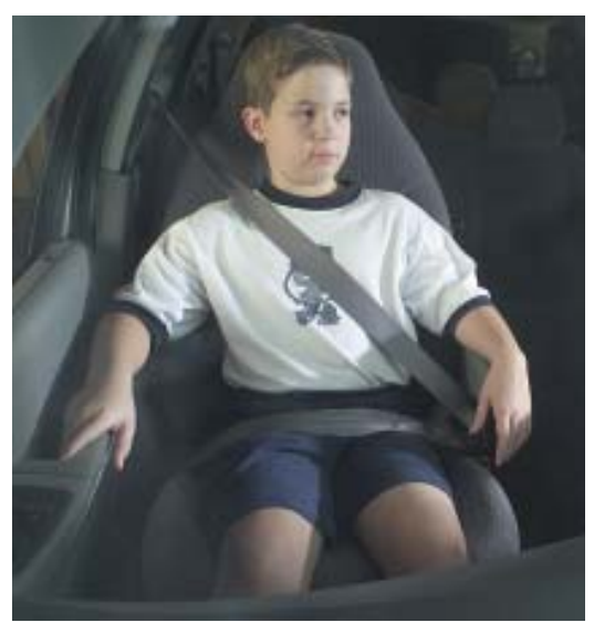
PROPERLY FITTED SEAT BELTS