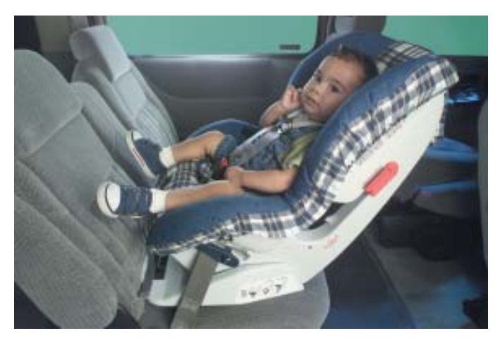
REAR-FACING CONVERTIBLE SEAT