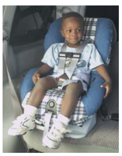
FORWARD-FACING CONVERTIBLE CHILD SAFETY SEAT