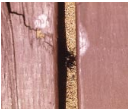
Figure 3: Leafcutter bee nesting on porch, with sawdust.

within the previously constructed tunnels. Then they provision each leaf-lined cell with a mixture of nectar and pollen. The female lays an egg and seals the cell, producing a finished nest cell that somewhat resembles a cigar butt. A series of closely packed cells are produced in sequence. A finished nest tunnel may contain a dozen or more cells forming a tube 4 to 8 inches long. The young bees develop and remain within the cells, emerging the next season.