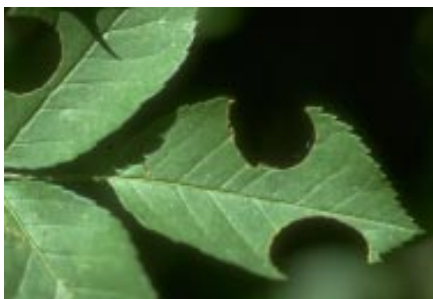
Figure 2: Leafcutter bee injury.