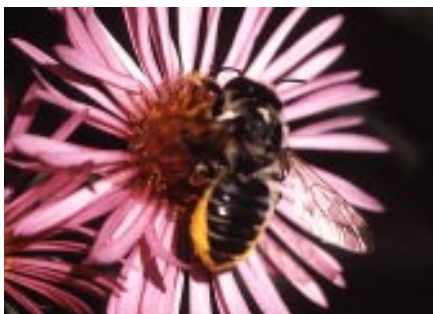
Figure 1: Leafcutter bee.