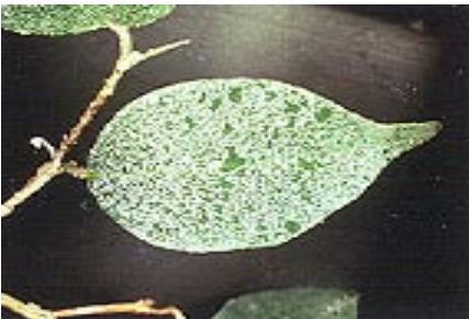
Figure 8. Honeydew produced by brown soft scale.