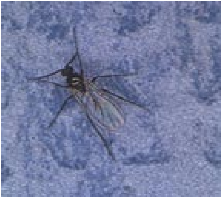
Figure 13. Fungus gnat adult.