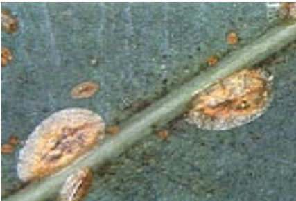
Figure 7. Brown soft scale.

Crawler stages are susceptible to most houseplant insecticides. However, insecticides must maintain coverage throughout an entire generation of the insect (two to four months) to eliminate further infestation. Short persisting insecticides, such as pyrethrins and resmethrin, need reapplying at least once per week. Longer persisting treatments, such as bifenthrin and permethrin are effective for scale control when used at longer intervals. Soil applied systemic insecticide imidacloprid should be effective for most soft scale infestations.