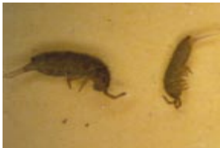
Figure 16. Springtails.

around windows. Fungus gnats cause little or no injury to house plants but create a serious nuisance problem. Problems are most common during winter and early spring. Since these insects develop in potting soil, virtually any houseplant can be a host for fungus gnats.