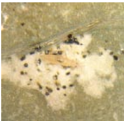
Figure 11. Thrips and associated damage.