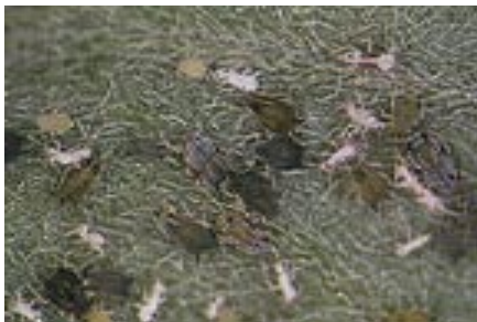
Figure 10. Chrysanthemum aphids.