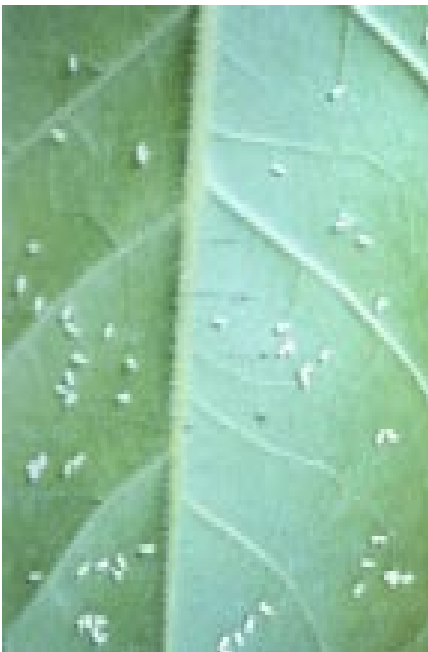
Figure 2. Greenhouse whitefly adults.