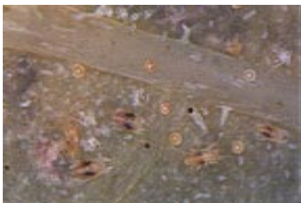
Figure 4. Twospotted spider mite and eggs.

Twospotted spider mite is difficult to control with pesticides. Horticultural oils are probably the most effective spray. Bifenthrin, found in many houseplant insecticide preparations, can also be effective for spider mite control. Insecticidal soaps are marginally effective.