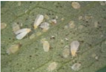
Figure 1. Greenhouse whitefly adult and nymphs.

When full grown, most female mealybugs produce a large amount of cottony material in order to lay hundreds of eggs. The eggs hatch within a few