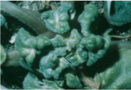
Figure 6. Cyclamen mite damage to African violet.

Management. Cyclamen mites can be very difficult to control since they occur deep within leaf folds and other protected sites. Therefore, it is usually recommended that cyclamen mite-infested plants be discarded.