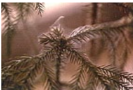
Figure 5. Spider mite webbing on Norfolk Island pine.