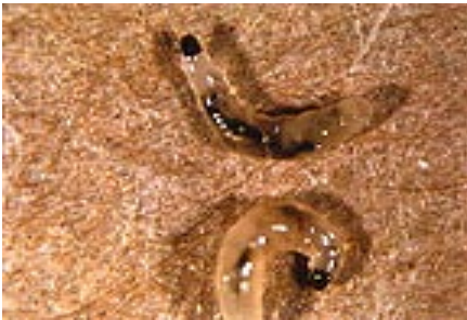
Figure 14. Fungus gnat larva.