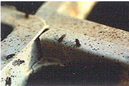
Figure 15. Shore flies and associated "fly specks".