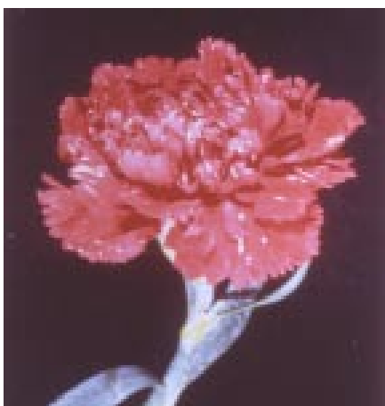
Figure 12. Thrips scarring of flowers.

period after egg hatch (crawler stage), are immobile. Horticultural oils are the most effective treatment for armored scales. Systemic insecticides provide poor control.